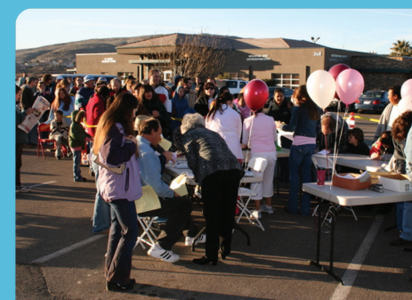
Lining up to sign in for last year's Dentistry With a Heart day. Our 5th annual event will be held Saturday, March 3rd.

Saturday March 3, 2012 Call for more details.